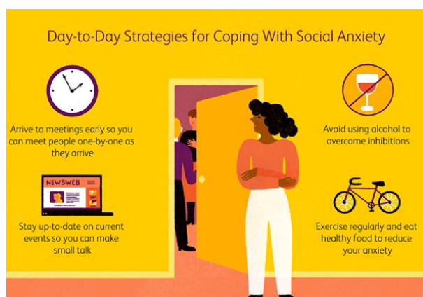
Figure 1) Coping With Social Anxiety

Training in anxiety and anxiety management skills, which provide appropriate methods for expressing and managing emotions, can be effective in reducing aggressive behavior (Figure 1). Using calm and positive dialogue and self-control can increase feelings of self-efficacy and social skills. In our society, anxiety must be controlled and controlled so as not to cause irreparable damage to the family and society.